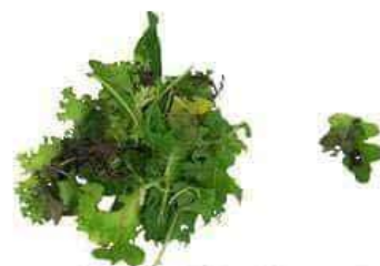
Acceptable leaves on the left, inedible leaves on the right