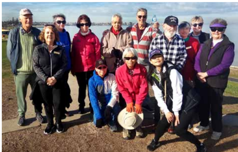
Some of the members of the Cheltenham Life Activities Club